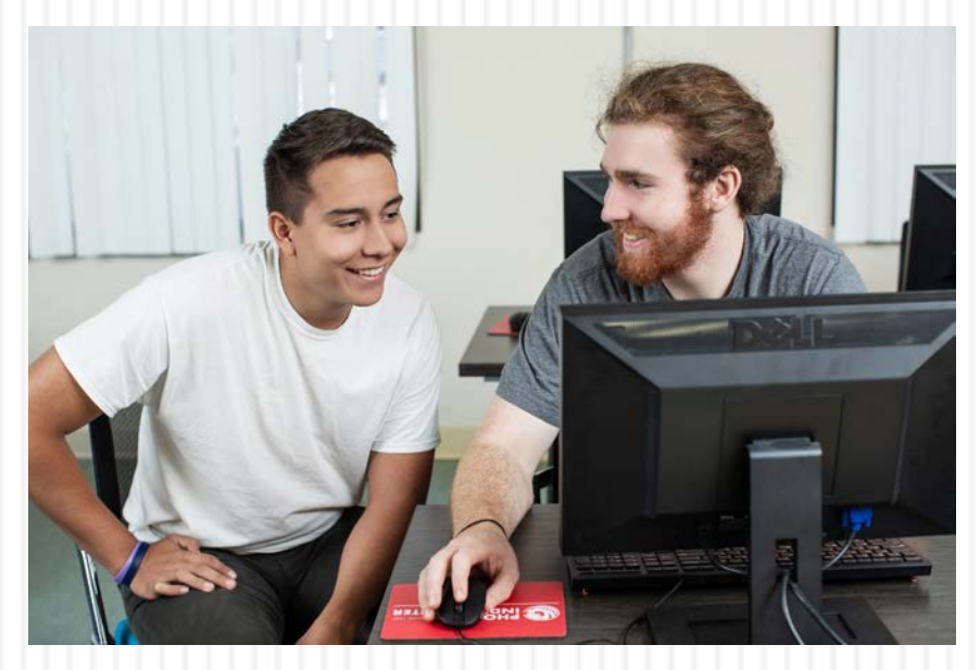
Enriching the Lives of American Indians for 73 years!